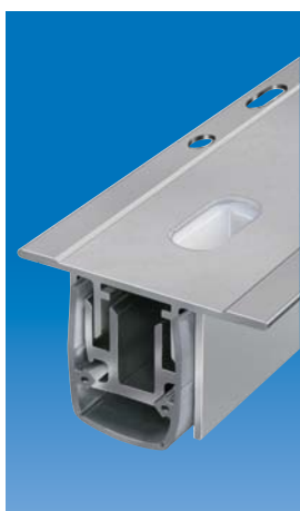
Option: Planet R0 with Drill hole 5×13 mm