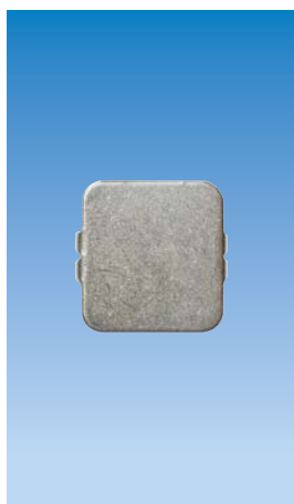
Planet stopping plate, type 1, stainless