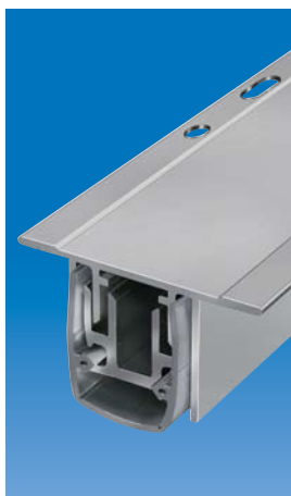
Planet R0 profile