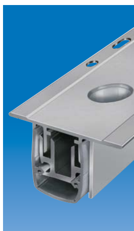
Option: Planet R0 with Drill hole Ø 10,8 mm