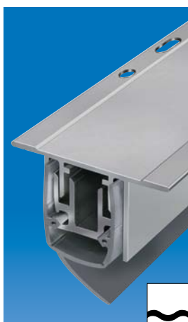
Option: Planet R0 bevel lip for wavy floors