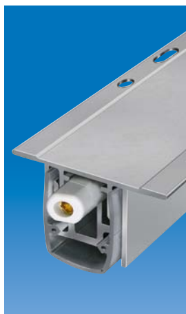
Planet R0 with release knob