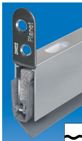
Option: Planet RH with Planet Drill hole 5×13 mm