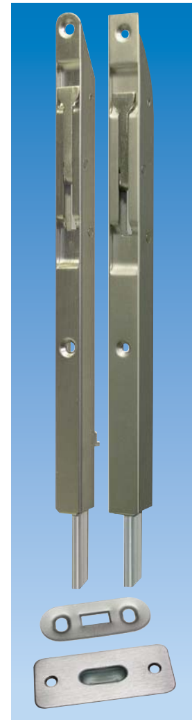
Planet KR flush bolt, incl. strike plate, refer to chapter Flush bolt | Drill hole.

Option: floor recess plate 5×13 mm, narrow