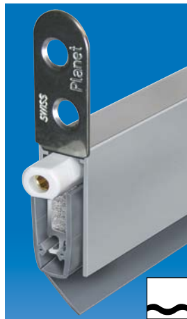
Planet RH with retaining bracket, release side