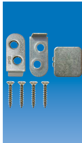
Planet assembly set HS