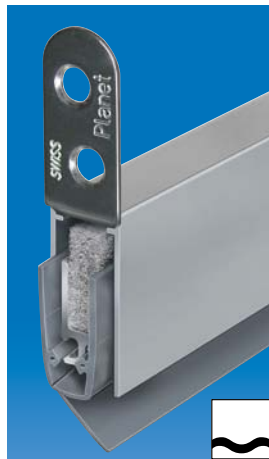
Planet RH profile