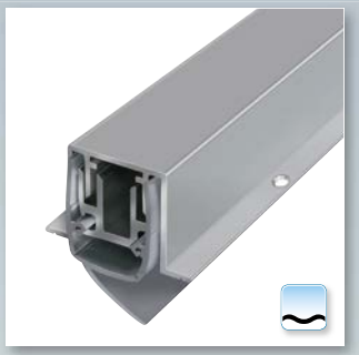
Option: Planet PU with bevel lip for uneven floors