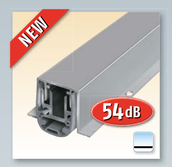
Option: Planet PU-plus for best sound protection