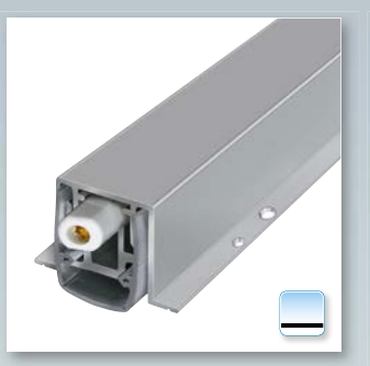
Planet PU, release side