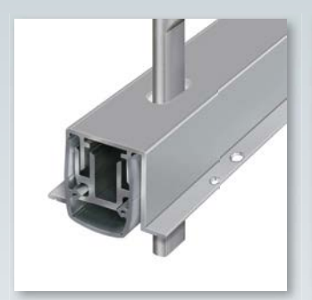
Option: Planet PU with Planet driving bar rod → refer to chapter Accessories | driving bar rods