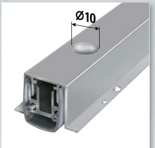
Option: Planet PU with Planet drill hole Ø 10 mm for flush bolt, driving bar rods → refer to chapter Accessories | driving bar rods