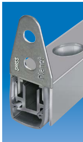
Option: Planet MF with Planet Drill hole Ø 10,8 mm