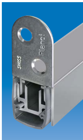
Option: Planet MF with retaining bracket for wooden doors