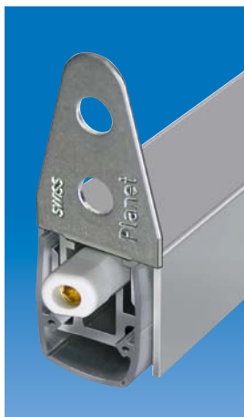
Planet MF with metal retaining bracket, release knob