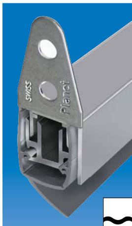
Option: Planet MF bevel lip for wavy floors