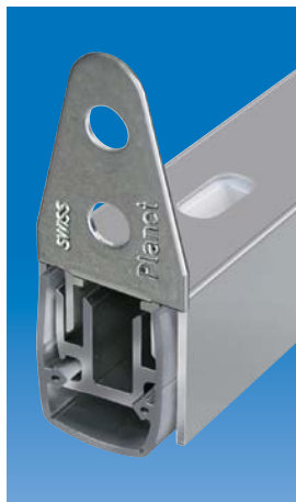
Option: Planet MF with Planet Drill hole 5×13 mm