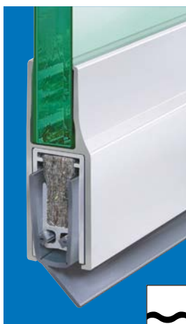
Option: Planet KG-F8 | F10 | F12, bevel for wavy floors