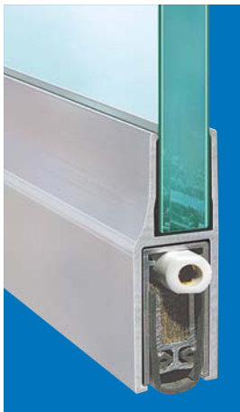
Planet KG-F8 | F10 | F12, attached and pasted