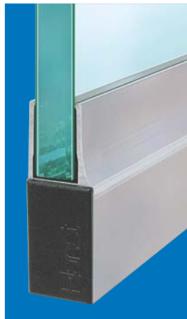
Planet KG-F8 | F10 | F12 with cover plate