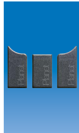
Planet KG, set of cover plates