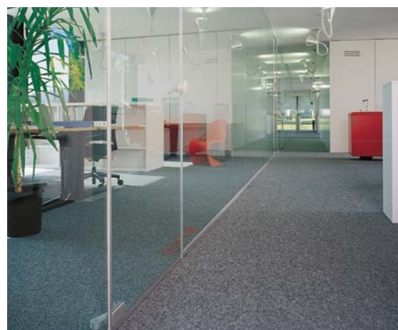
Planet KG-U application in an office building