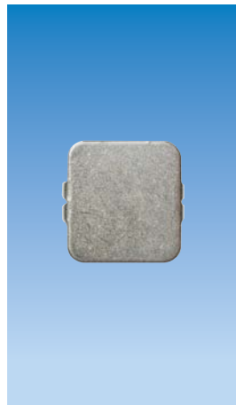
Planet covering plate type 1, stainless