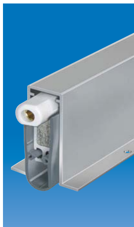
Planet FT, release side