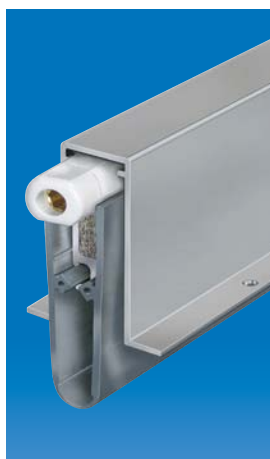
Option: Planet FT+8, release side