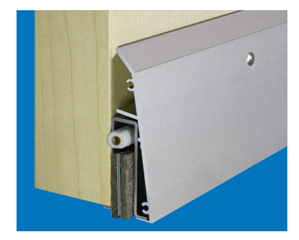
Option: Planet BL with Planet Socle